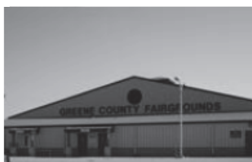
BUILDING 2 120' X 160'