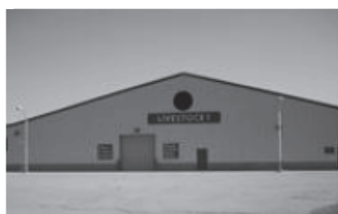
BUILDING 1 150' X 160'