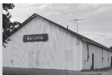
EXPO HALL 150' X 50'

The Expo Hall has features to make it great for auctions and parties.