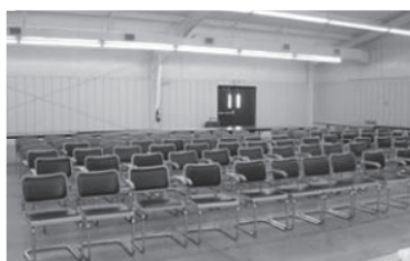
DINING HALL 65' X 60'

The Dining Hall has features to make it as versatile as your event is unique. This building has almost the same amenities of those twice its size. Rent entire building (seats approx. 175).