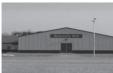
ASSEMBLY HALL 70' X 170'

The Assembly Hall is perfect for reunions, receptions, proms, flea markets, antique shows, garage sales, birthday parties, social events, auctions, fundraisers, get-togethers. Rent entire building (seats approx. 750) or rent one-half building (seats approx. 350). Room can be divided by wall.